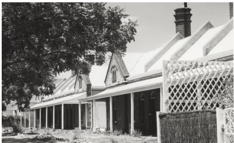
December 1971