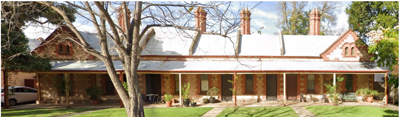
Lady Ayers Homes, 51 – 60 Kingston Terrace